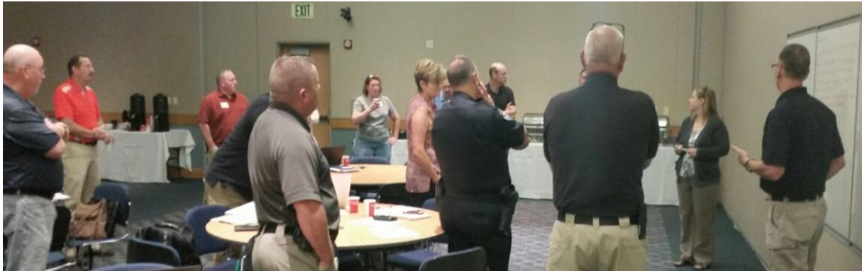
Coordinators from around the state, faculty and employers from Juvenile Court/Youth Services, Police Chiefs and Sheriffs, and other law enforcement officials discussed and identified curriculum.