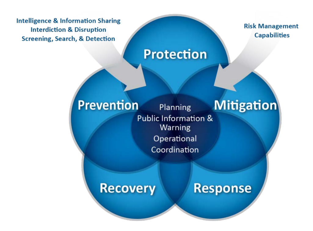
Figure 1: Protection and Integrated Core Capabilities

Collectively, the core capabilities for the Protection mission area provide the foundation for achieving the overarching critical objective for Protection: a homeland that is protected from terrorism and other hazards in a manner that allows American interests, aspirations, and way of life