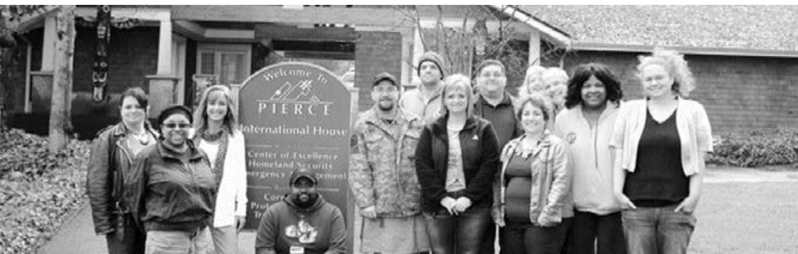
Picture of HSEM students at Community College Citizen Preparedness Program (3CP2) training; April 2013

The Center of Excellence Homeland Security and Emergency Management is designated by statute (HB1323) to serve as the lead for the coalition of all 34 Washington State Community and Technical Colleges with over 500,000 students, of which 46% enter the workforce each year.